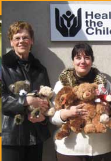
▲ Teddy Bears for Tots 400 bears donated