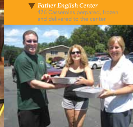
▼ Father English Center 476 Casseroles prepared, frozen and delivered to the center