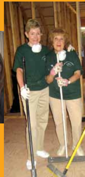
▲ Paterson Habitat Workdays 1600 manpower hours