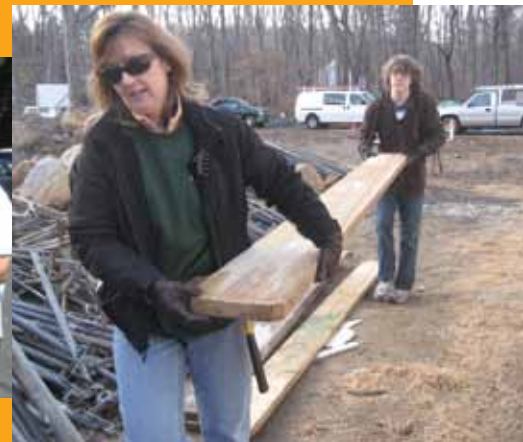
▲ Hammering for Habitat $3284 donated to Paterson Habitat for Humanity