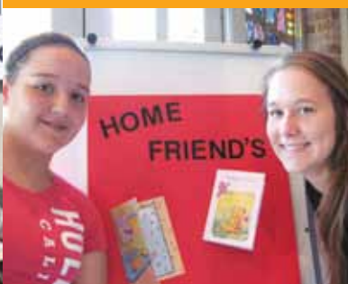
▲ Home Friends Program Home friends for 125 residents of NDC